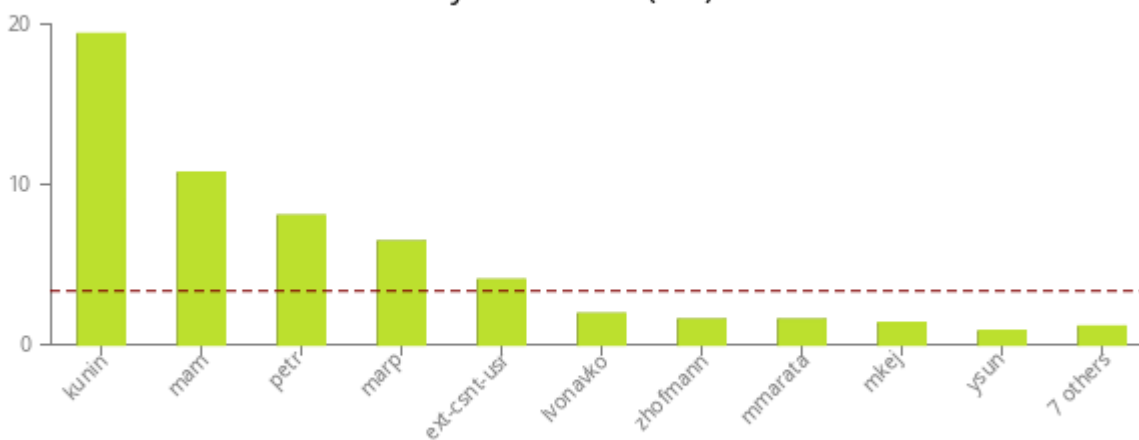
7 Day User Traffic (MB)